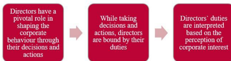
Figure 3 Relationship Between the Key Concepts of Corporate Interest and Directors' Duties

The first identified problem specifically deals with directors' duties. It states that 'directors' duties and company's interest are interpreted narrowly and tend to favour short-term maximisation of shareholders value' (emphasis added). Therefore, it identifies the interpretation of these two concepts ((i) directors' duties and (ii) company's interests) as a single combined cause that favours shareholder interests. It seems like the choice of making a combined statement with these two elements was a deliberate decision.